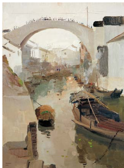
Figure 4. Wu Guanzhong, oil painting, Hometown Morning.

In the composition, the artist also needs to consider the treatment of light and shadow. The direction and intensity of the light, as well as the shape and length of the shadows, all have an important impact on the three-dimensional and spatial feel of the picture. Through the guidance of light, the focus of the picture can be highlighted and the visual impact can be enhanced. At the same time, the contrast of light and shadow is also an important means to form the rhythm and rhythm of the picture. The use of lines in composition can not be ignored. Lines can be the outline of the object in the picture or the texture in the background. They not only outline the shape of the object, but also guide the viewer's eye flow and enhance the dynamic sense of the picture. Changes in the thickness, curvature and density of the lines can have an impact on the overall effect of the picture. 4