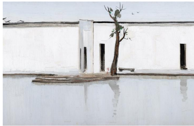
Figure 3. Wu Guanzhong, oil painting ,Double Swallows.

In today's era, calligraphy is not only a traditional writing skill, but also an art form full of intentionality and even abstractness. It originates from ancient hieroglyphics, which were originally created to record historical events and express human emotions. They are a kind of abstraction and generalization of the image of objects in nature or the inner feelings of individuals. The creation of hieroglyphics is not only writing, but also a kind of painting art, which is the original form of the theory of "homology of painting and calligraphy" in traditional Chinese painting theory. 3